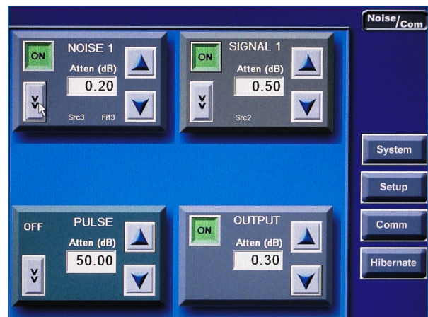
Intuitive standard control menu