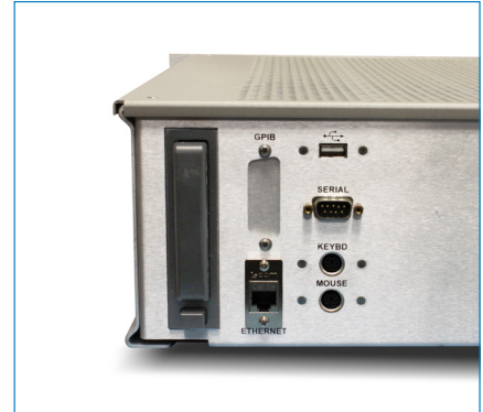
Removable drive - U7opt17