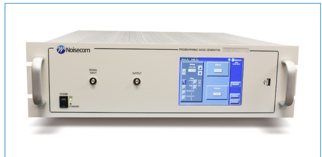
3U High - U7opt18